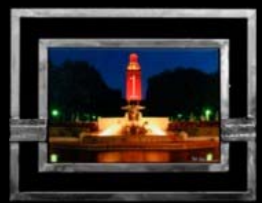
Rose Bowl 41-38 I