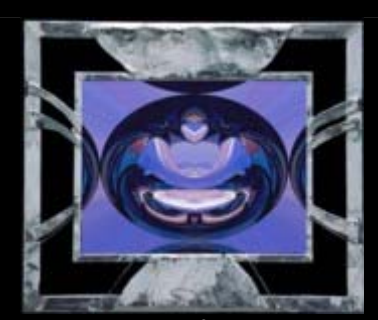
Eye of 360